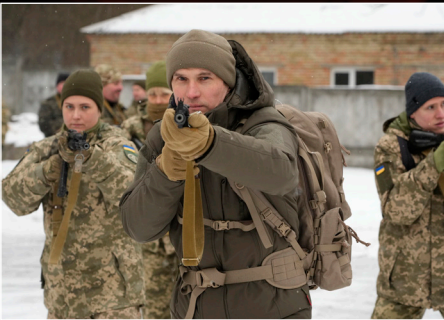
CPJ mobilized to secure a statement on journalist safety from the Media Freedom Coalition. We worked to ensure the inclusion of journalists in accountability processes with the OSCE Moscow Mechanism—established to assess potential war crimes in Ukraine—and we liaised with USAID and the U.S. National Security Council to share the concerns of journalists in Ukraine.