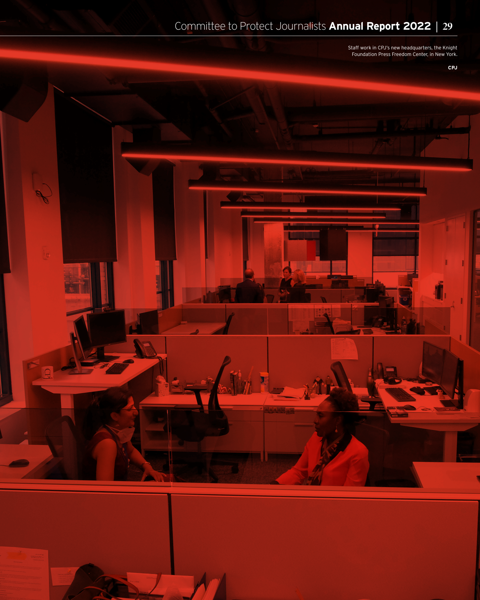
Staff work in CPJ's new headquarters, the Knight Foundation Press Freedom Center, in New York.