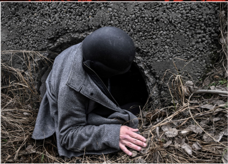
CPJ disbursed crucial safety advice in Ukrainian, Russian, and English to help journalists who cover the war. These advisories cover a wide range of situational risks—from civil disorder, arrest and detention, and internet shutdowns, to assessing digital threats. CPJ also offers one-on-one safety consultations for more specific questions journalists ask.

Here are some of the ways we’re taking action.