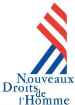
Plate-Forme de la Société Civile pour la Démocratie