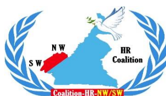
Civil Society Coalition on Human Rights and Peace in the North-West and South-West (The Coalition)