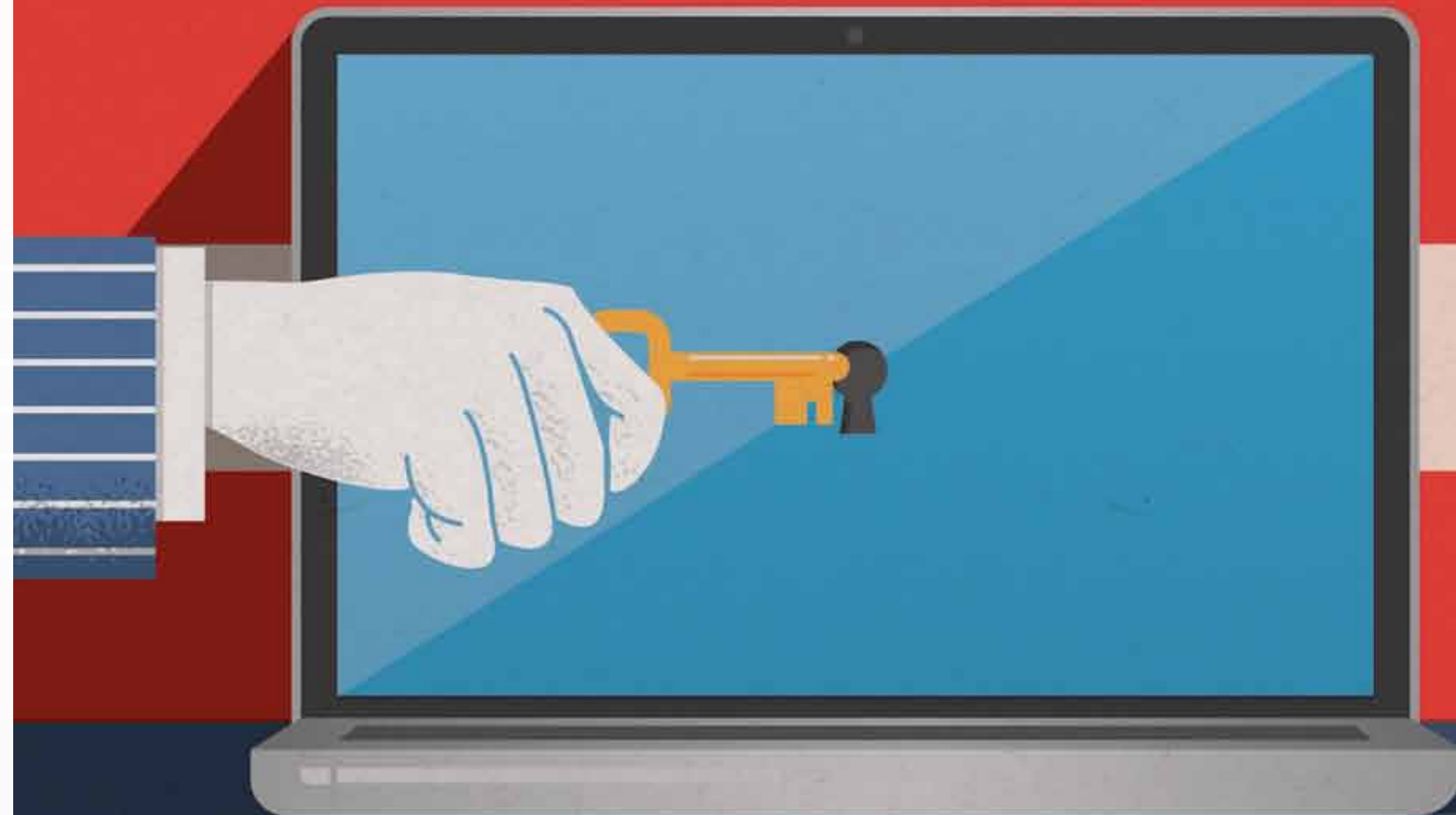
ILLUSTRATION BY ERICK MONTES

The FBI and U.S. Department of Justice pushed for the creation of technical “backdoors” to unlock data for criminal investigations. CPJ called on Western governments to safeguard encryption in order to protect the integrity of journalistic communication, and keep digital data safe from malicious actors and authoritarian governments.