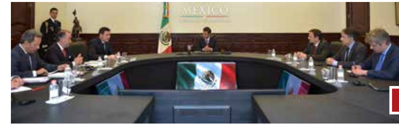
A CPJ delegation meets with Mexican President Enrique Peña Nieto in May.

MEXICO RANKS AMONG THE MOST DANGEROUS COUNTRIES FOR JOURNALISTS IN THE WORLD