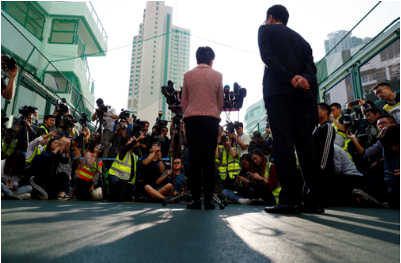
Hong Kong Chief Executive Carrie Lam speaks to the media after casting her vote at a polling station during district council local elections in Hong Kong on November 24, 2019.

Protesters also heckled and harassed TVB reporters on the street doing their jobs.