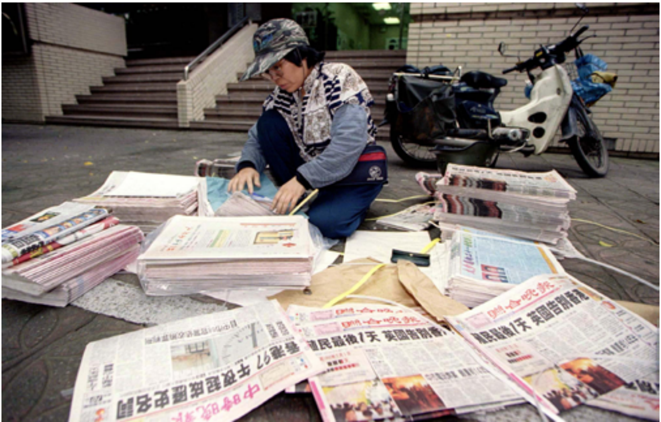
A Taipei newspaper delivery woman counts piles of evening newspapers bearing headlines of Hong Kong's midnight handover to Chinese rule on June 30, 1997.

prosperity—is a riddle for which there isn't yet a satisfying answer.