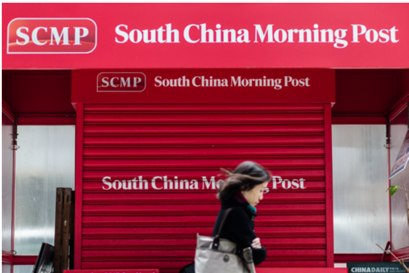
A pedestrian walks past a closed newsstand with the logo of the South China Morning Post (SCMP) in Hong Kong on December 12, 2015, following the acquisition by Chinese internet giant Alibaba of the English-language newspaper.