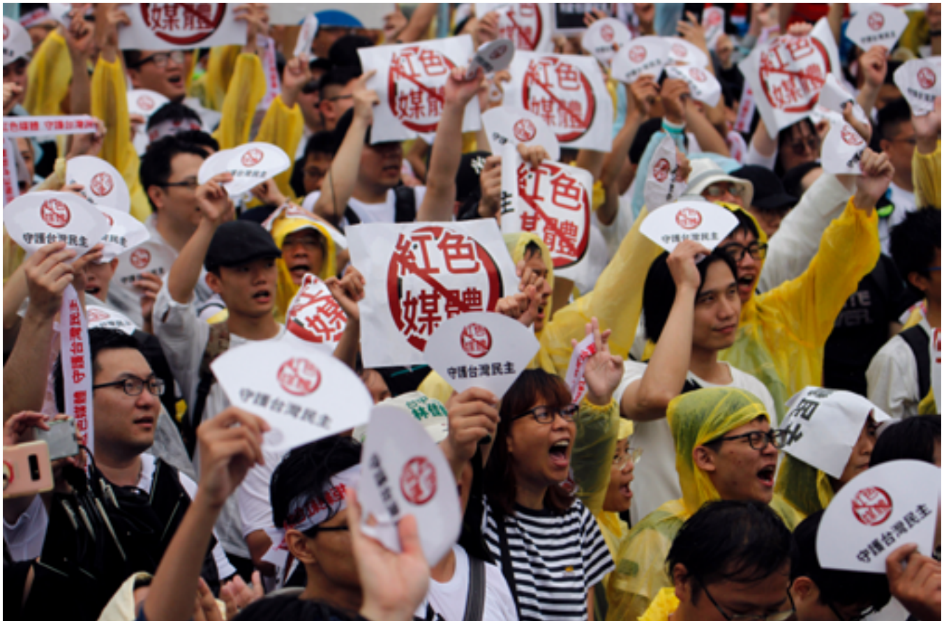
In this photo taken on June 23, 2019, protesters hold placards with messages that read “reject red media” and “safeguard the nation’s democracy” during a rally against pro-China media in front of the Presidential Office building in Taipei.

workers, whose families often came from the mainland. Yet news reports noted that his rise was accompanied by the widespread circulation of false news stories on social media that appeared to benefit him. Taiwan News , for example, reported several instances of false, viral, social media posts, including one claiming that his opponent in a debate was being fed answers through an earpiece, and another falsely claiming that his opponent begged attendees at a rally not to leave. “While there is no specific story which has swung public opinion away from the DPP and towards Han, the steady stream of false stories, lies, and misleading propaganda has had a cumulative effect,” the paper reported. In another instance, the Liberty Times reported that politicians cited false stories that Han led in polling conducted by a university that had never conducted any polling. A recent analysis in Foreign Policy pointed to “a campaign of social media manipulation orchestrated by a mysterious, seemingly professional cybergroup from China.”