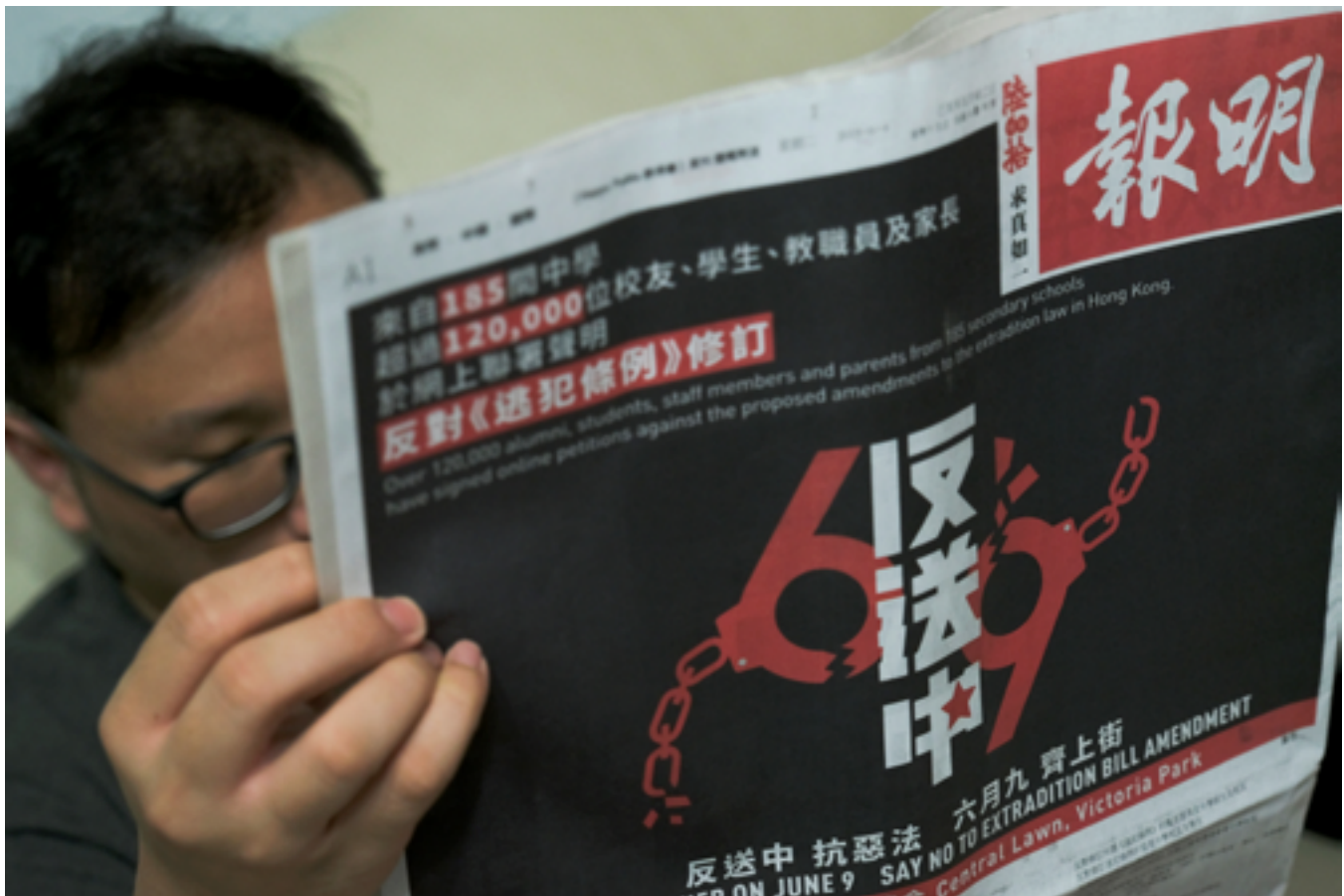
A front page of Hong Kong's newspaper Ming Pao with a joint petition against the proposed extradition bill, is seen in Hong Kong on June 4, 2019.

commercial interests lie in trying to curry favor with Beijing on their own initiative.