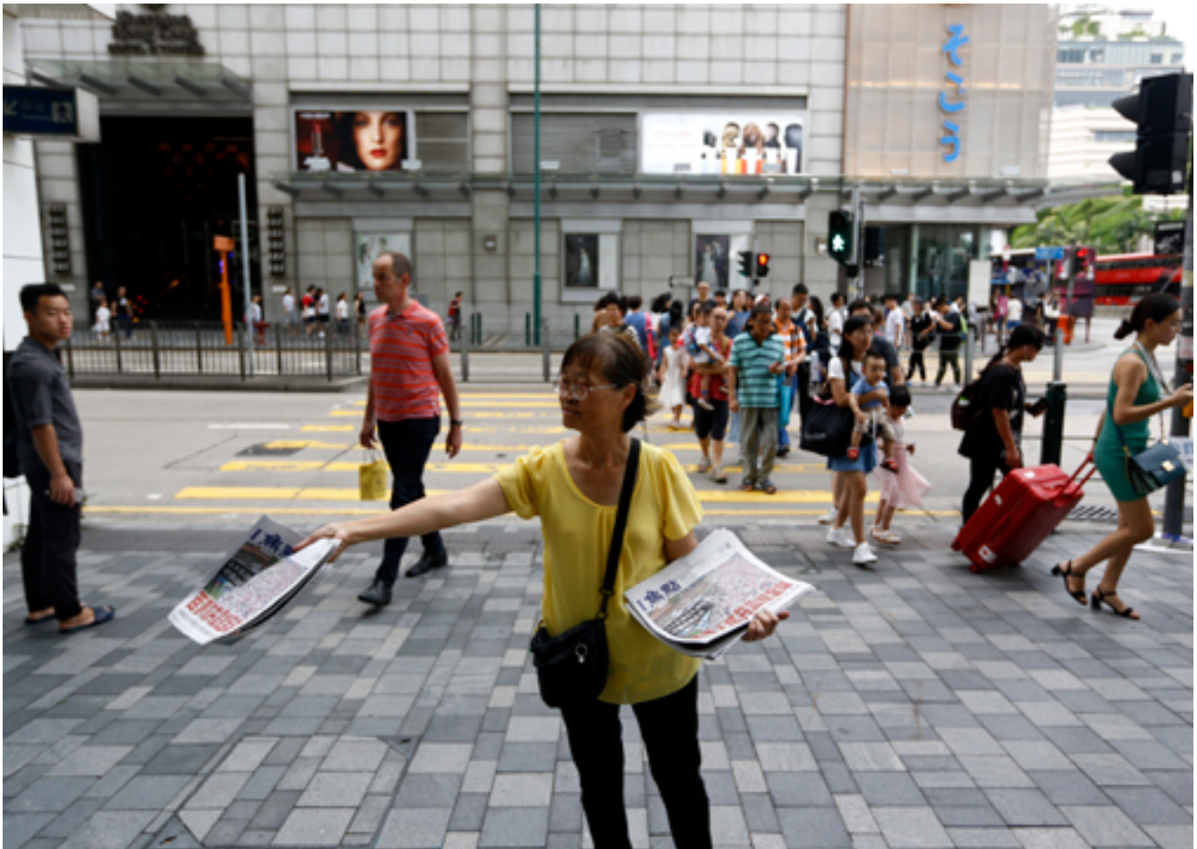
A Hong Kong woman distributes newspapers with the headlines 'Millions against Communist China shock the world' in a shopping district popular with mainland Chinese tourists in Hong Kong Sunday, July 7, 2019.

despite repeated assurances by [then] Police Commissioner Stephen Lo Wai-chung that they were sincere in cooperating with the media. There are concerns that people's right to know will be jeopardized if reporters are not given easy and safe access to the places where news are unfolding." Police have repeatedly denied to CPJ by email that attacks on journalists are intentional.