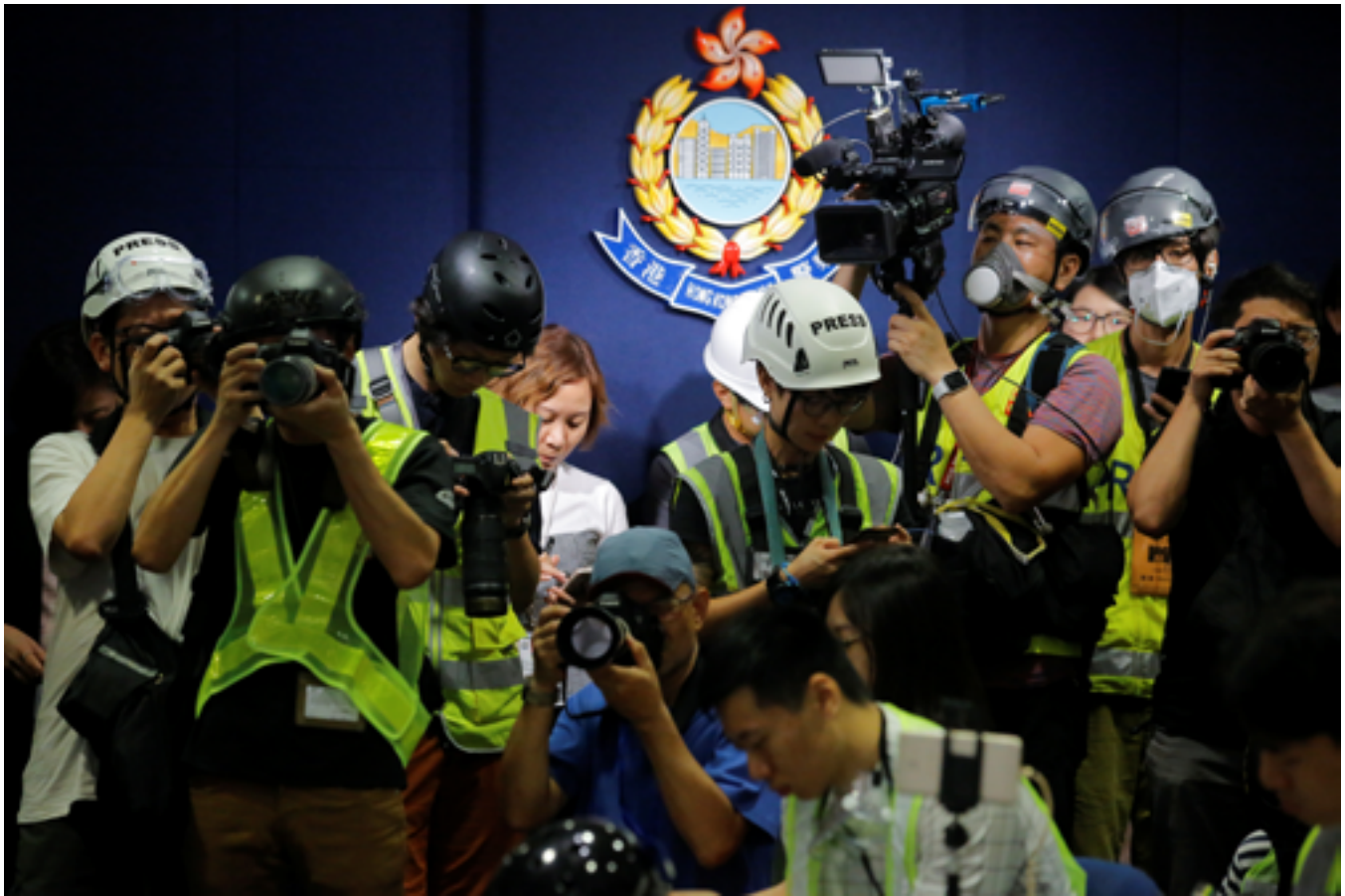
Press photographers in Hong Kong on June 13, 2019, wear helmets and protective masks to a police press conference to protest how police treated journalists during the previous day's demonstration against a proposed extradition bill.

fear their permission to stay in Hong Kong could be taken away. Digital security and the future of internet freedom feel precarious.