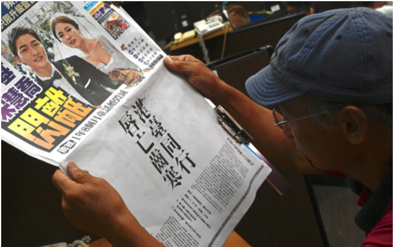
This photo shows a journalist reading an advert placed in the Apple Daily newspaper in Taipei on June 28, 2019, placed by a Hong Kong campaign group calling for solidarity with Hong Kong protesters demanding the withdrawal of a bill that would allow extraditions to the Chinese mainland.

2020 race where he'll face the DPP's Tsai. The DPP has leaned toward independence and incurs strong criticism from China, while the KMT favors friendlier relations with the mainland.