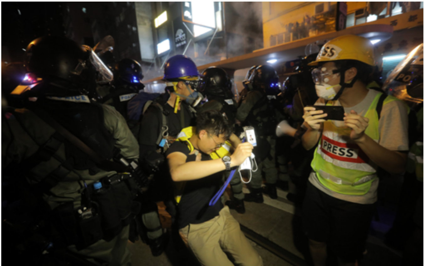
A journalist is injured as riot police and protesters clash near China's liaison office in Hong Kong on July 28, 2019.

and the introduction of “patriotic” education, according to news reports . Lam also received a strong endorsement from China’s leadership, according to reports , dimming prospects for further accommodation to protesters’ demands.