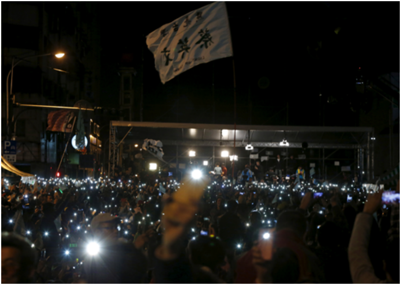
Supporters of Democratic Progressive Party (DPP) Chairperson and presidential candidate Tsai Ing-wen hold up their mobile phones as they celebrate Tsai's election victory in Taipei, Taiwan, on January 16, 2016.

win the Kaohsiung mayoral election and said he believes that a better relationship with China would be good for Taiwan.