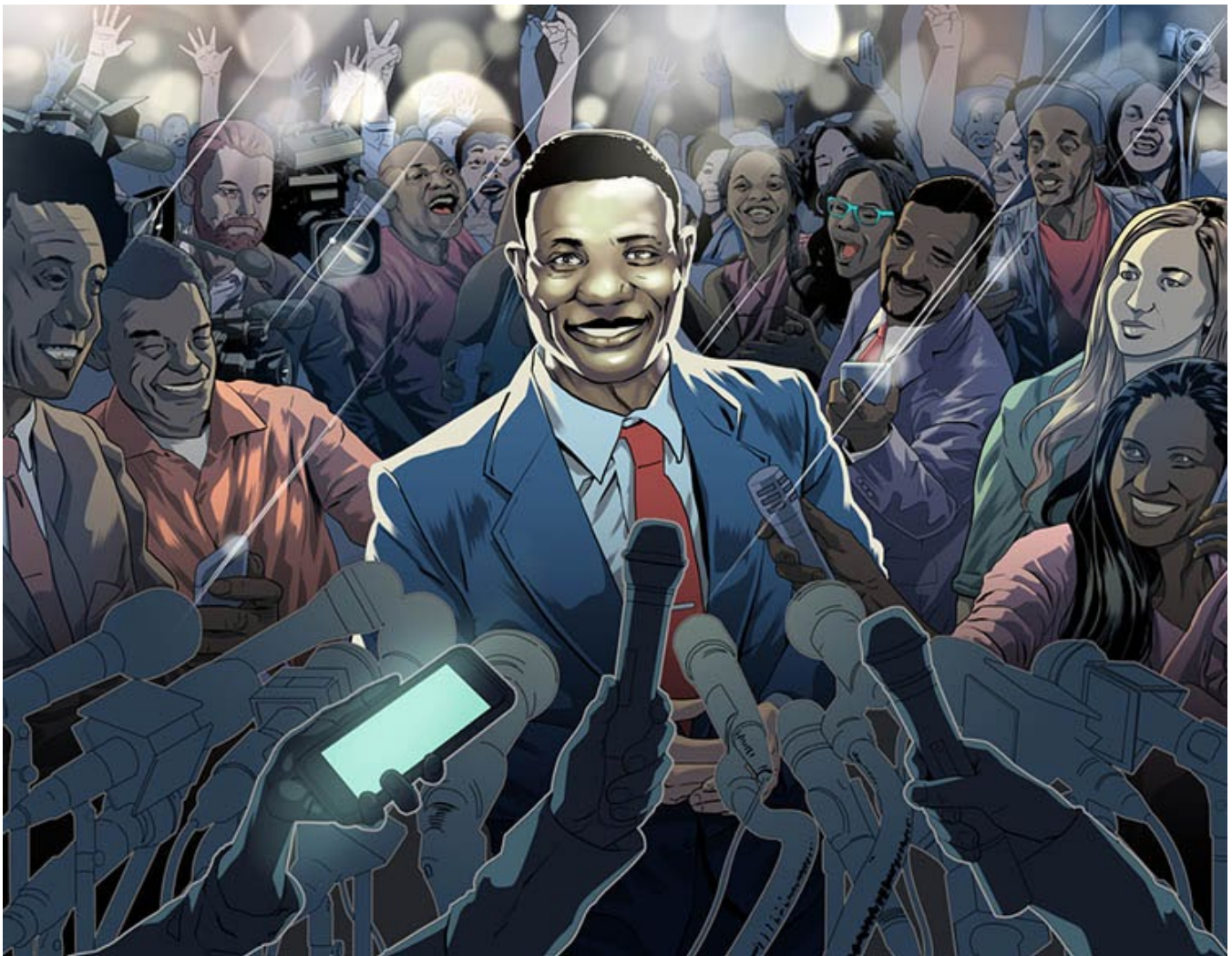
Artwork: Jack Forbes

India is scheduled to hold national and provincial elections from April 11 to May 19, 2019. As the country celebrates over 70 years of democracy, journalists are under pressure from attacks, harassment, cyber bullying, and government restrictions. At least five journalists were killed in relation to their work in India in 2018, including four who were murdered, according to CPJ research .