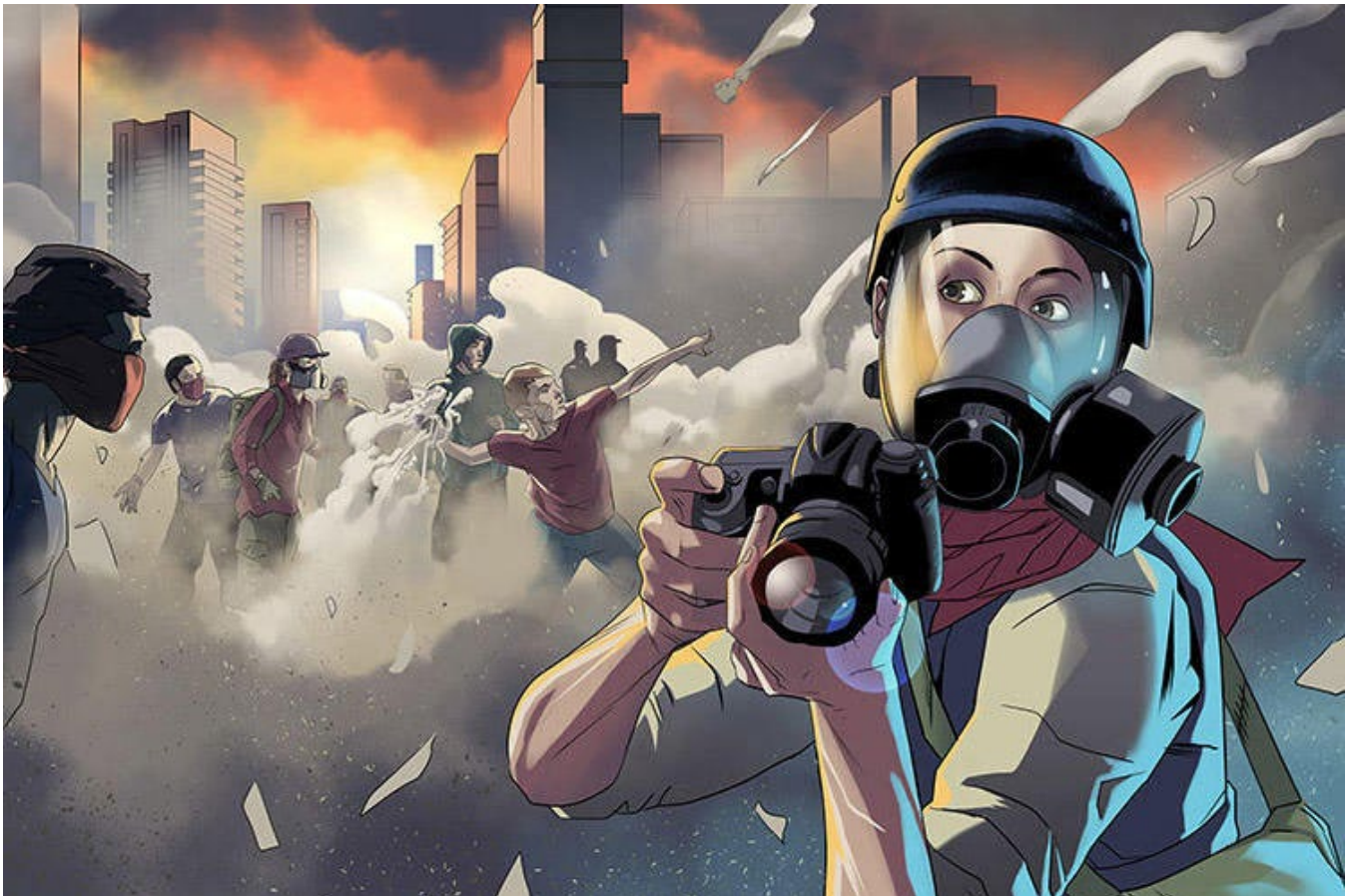
Artwork: Jack Forbes