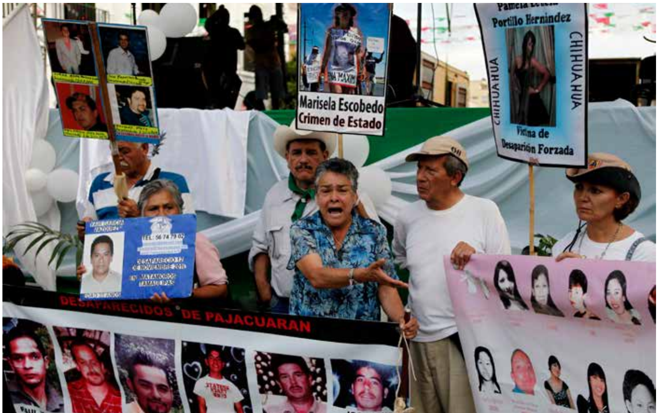
Images of victims from drug cartels and gangs in Oaxaca are held up at a rally in 2011. The state is home to a thriving drug trafficking operation that has driven up the murder rate.