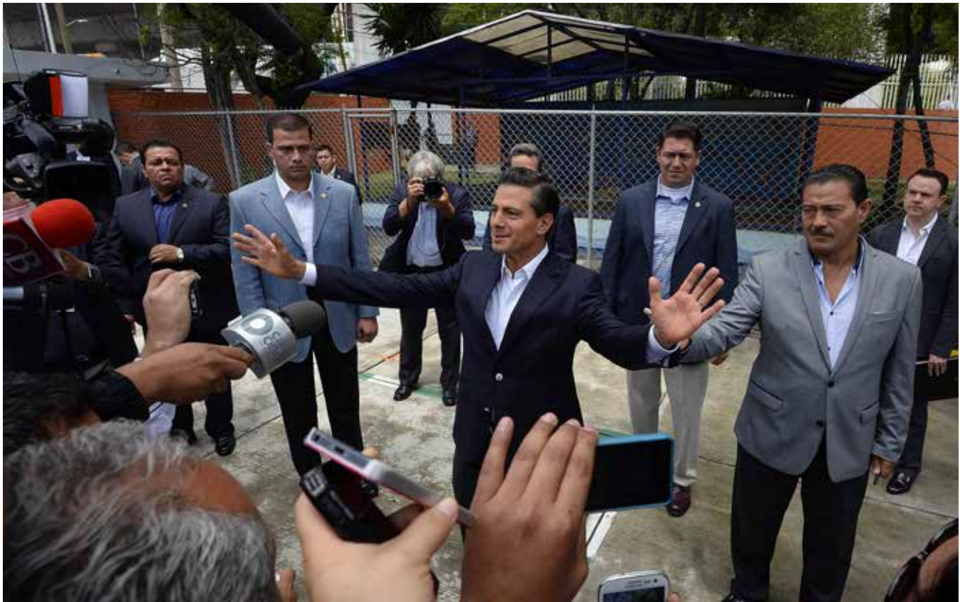
President Enrique Peña Nieto speaks with the press in Mexico City, in June 2015. Peña Nieto has publicly condemned attacks on journalists but more needs to be done to end the violence.

instance, police identified a mastermind—a city mayor—but bureaucratic delays allowed him to evade justice. Jiménez's case is an example of how Veracruz authorities consistently refuse to acknowledge a connection between a victim's journalism and murder, and try to frame it as a regular crime.