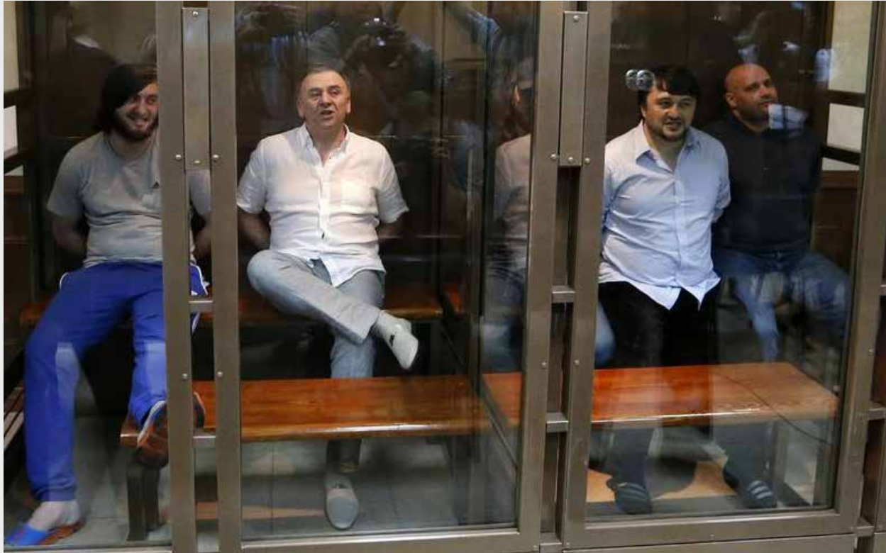
Defendants await sentencing in the murder trial of Russian journalist Anna Politkovskaya. No mastermind has been identified in her killing 10 years ago.

Getting away with murder: Government officials, political groups