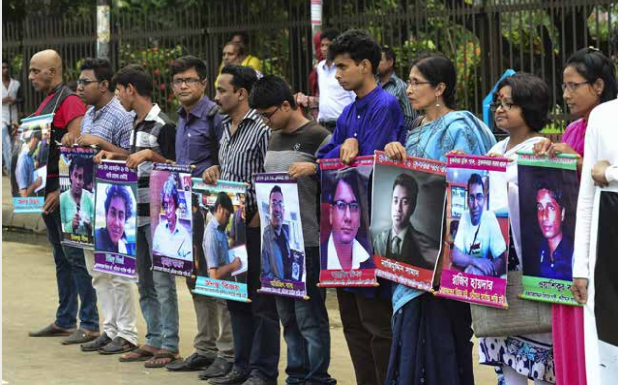
Protesters in Dhaka hold images of writers and activists murdered by extremists. Secular bloggers are the journalists most at risk for their work in Bangladesh.