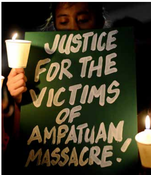
A vigil marks the anniversary of the Maguindanao massacre, in which 32 journalists and media workers were killed. No one has been prosecuted for the murders.

The Impunity Index, published annually to mark the International Day to End Impunity for Crimes against Journalists on November 2, calculates the number of unsolved murders over a 10-year period as a percentage of each country's population. For this edition, CPJ analyzed journalist murders in every nation that took place between September 1, 2006 and August 31, 2016. Only those nations with five or more unsolved cases for this period are included on the index—a threshold that 13 countries met this year, compared with 14 last year. Cases are considered unsolved when no convictions have been obtained; cases in which some but not all perpetrators are held to justice are classified as partial impunity and are not included in the tally. Cases in which the murder suspects are killed