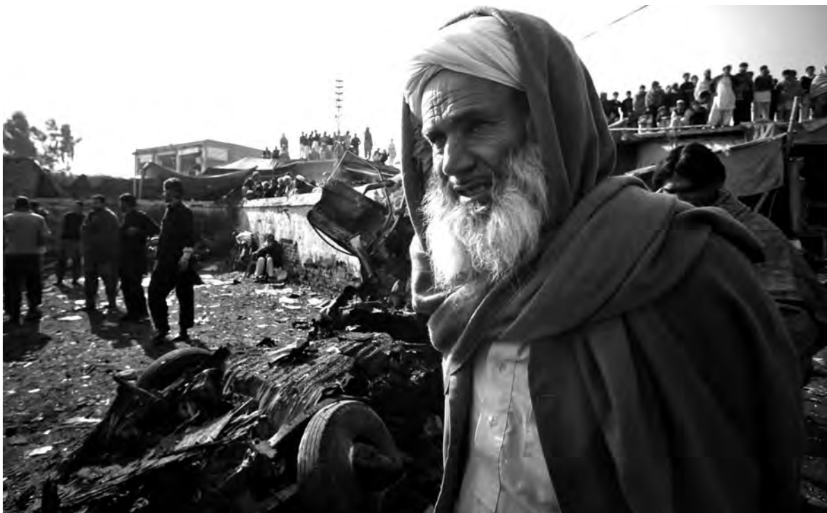
A Pashtun tribesman at the site of a 2012 bombing in Jamrud, Khyber Pakhtunkhwa province.

The consensus among many journalists is that Hashimzada was another victim of an agency killing. To them, the pattern is obvious.