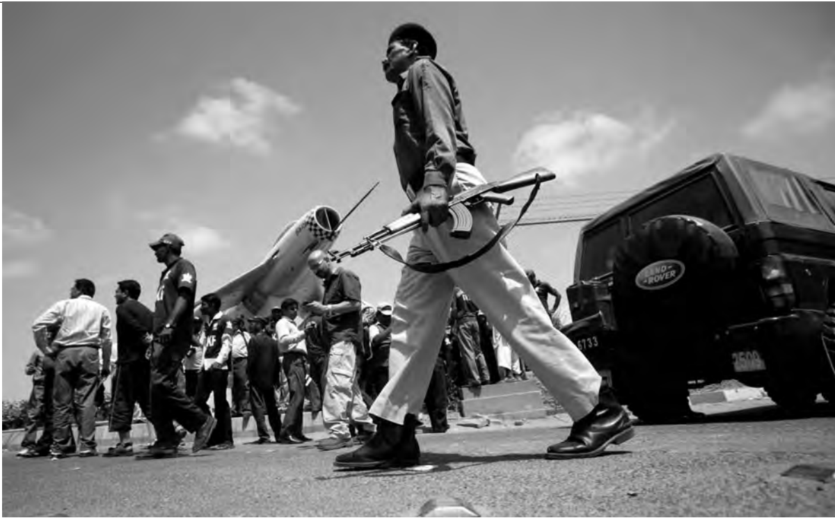
A police officer at the gate to the Mehran naval base. Al-Qaeda's attack on the base put the military further on the defensive.