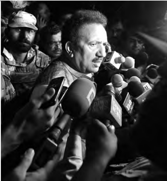
Rehman Malik, the former interior minister, speaks to reporters.

constituted about 11 percent. Since the earthquake in 2005 and the continuing Pakistani army operations in the tribal areas and Khyber Pakhtunkhwa province, Pashtuns have migrated in huge numbers to Karachi and shifted the balance. Estimates say the Pashtuns now make up more than 20 percent of the population.