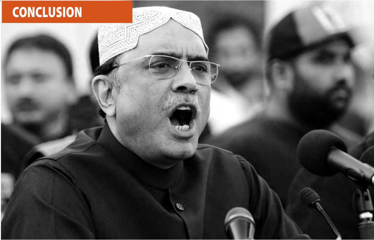
President Asif Ali Zardari speaks on the fifth anniversary of the assassination of his wife, Benazir Bhutto.

T he murder of Saleem Shahzad in May 2011 galvanized journalists across Pakistan in a way that few other events have. For a short time their power as a “union” was felt. They secured a commission of inquiry. They named ISI officers who had threatened Shahzad and many other journalists. They detailed those encounters in a public record available on the Internet. The resulting report offers a series of promising recommendations, saying in part: