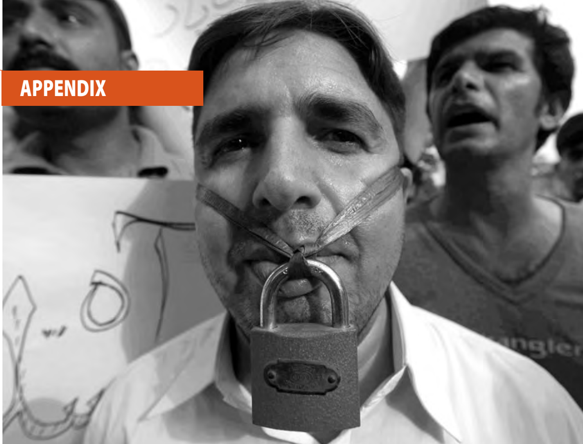
A lock symbolizes the choice facing many Pakistani journalists: Keep silent or risk attack.