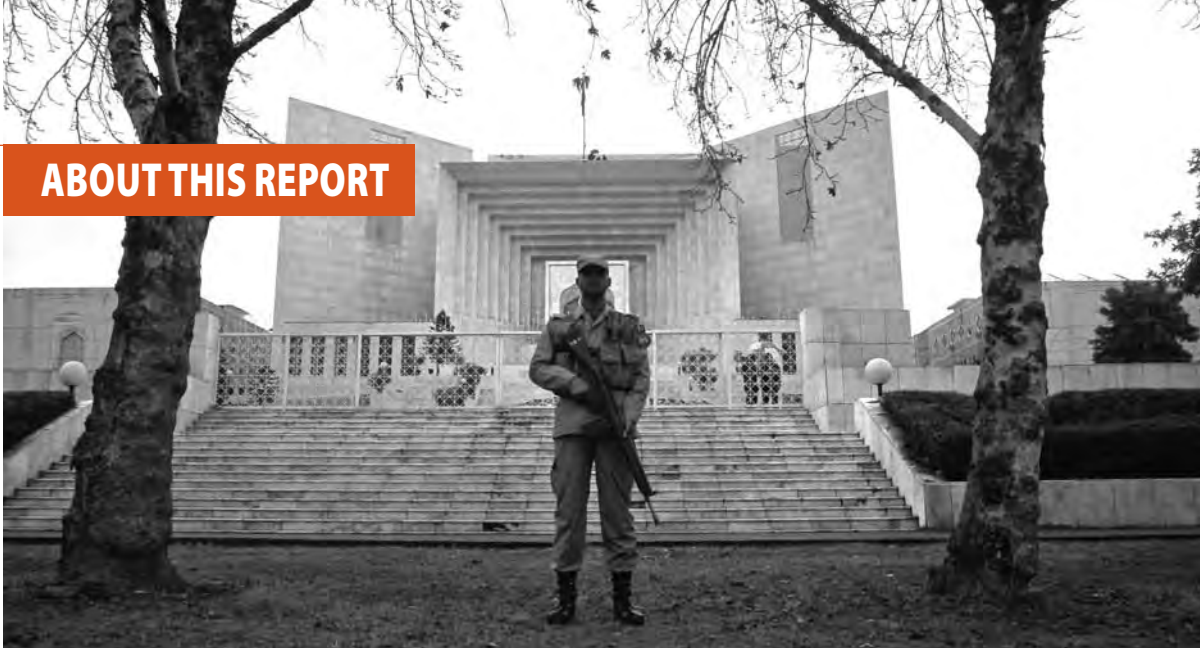
A security guard outside the Supreme Court in Islamabad.