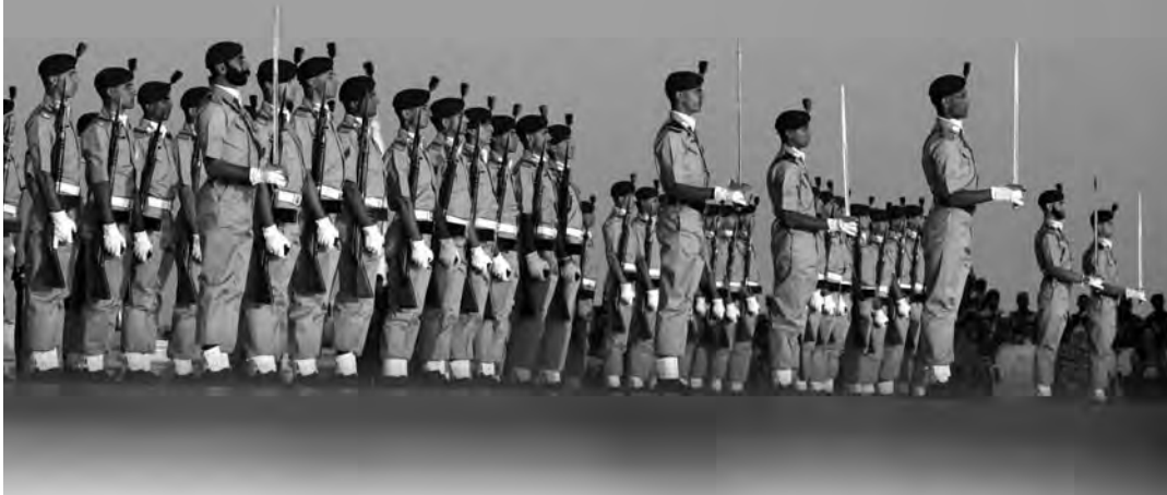
Pakistan Air Force cadets in Karachi.