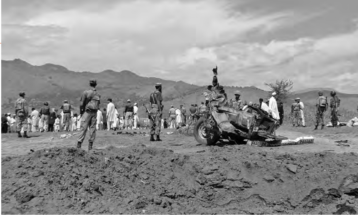
The Taliban claimed responsibility for this roadside bombing in Khyber Pakhtunkhwa.