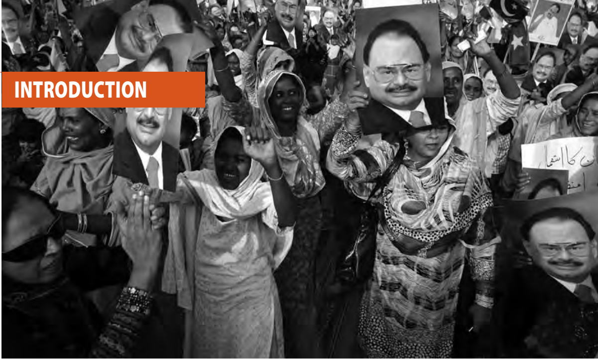
MQM supporters with portraits of party leader Altaf Hussain.