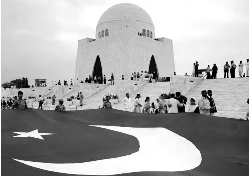
The Pakistani flag at the mausoleum of the country's founder, Mohammad Ali Jinnah.