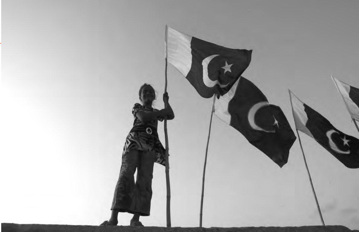
In Karachi, flags billow in the wind just before Independence Day.