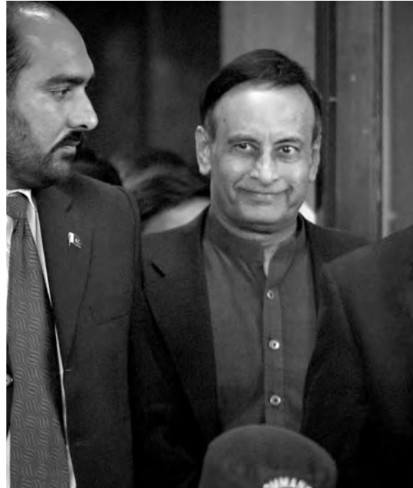
The security establishment was furious with Husain Haqqani, ambassador to the United States, for issuing visas to so many U.S. citizens.

F rom the military's point of view, why would commanders want real reporting to emerge during their operation in Swat? It would expose too much about the army, particularly the ISI's complicity in the rise of the Swat Taliban, and it would undermine their propaganda. A BBC editor told me that in 2009, the network was running FM broadcasts in Charsadda near Mohmand. "The military shut it down after the Swat operation in 2009. They told us, 'We are running a propaganda campaign in Pakistan and anything that goes against that screws up this campaign.'" Tellingly, Radio Free Europe/Radio Liberty and Voice of America do not even have transmitters or towers in Pakistan. "Even our transmitters are in Muscat," in Oman, said the BBC editor. "There's no mobile,