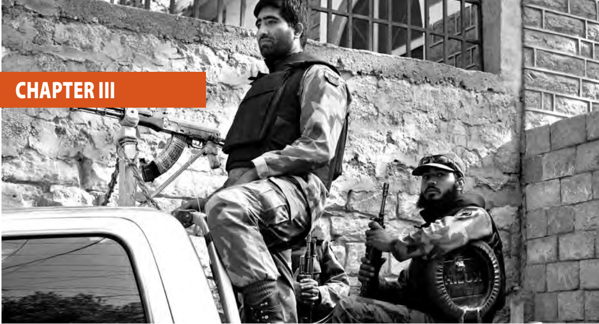
Soldiers guard a street in Gilgit after an extremist group threatens violence.