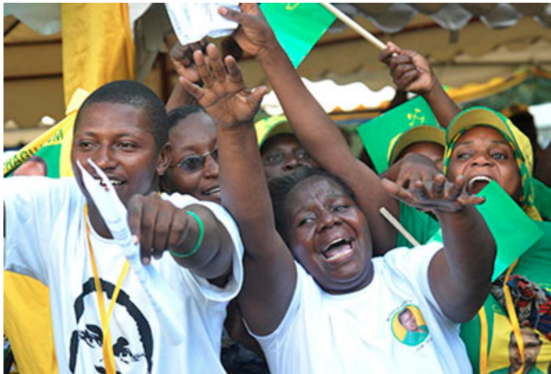
Chama Cha Mapinduzi supporters celebrate after Jakaya Kikwete wins the 2010 election. The next elections are scheduled for 2015.

Chama Cha Mapinduzi could face its tightest race yet in presidential and parliamentary elections scheduled for 2015, local journalists said. Theophil Makunga, Mwananchi's group managing editor, said the ruling party is particularly losing ground in its former rural strongholds. "So the opposition has gone from simply being a critic of the ruling party to the enemy," Makunga said. Chama Cha Mapinduzi is not taking the criticism easily. In response to public protests and reports of excessive police tactics, Prime Minister Mizengo Pinda told parliament in June that the government is tired of "stubborn people." He went on to endorse violent government suppression. "I am saying beat them up ... because there is not any other way ... for we are tired of them," the premier announced unapologetically in cabinet, according to news reports.