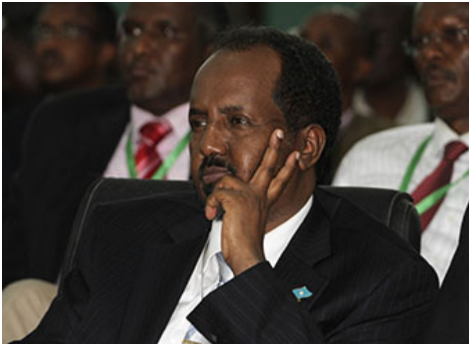
President Hassan has asked for faith.

The release of CPJ's 2013 index comes at a pivotal moment in the global struggle against impunity. A U.N. plan to combat deadly anti-press violence gets under way this year, with Pakistan being an early focal point. Among its many measures, the plan aims to strengthen journalist safety programs and assist member states in developing ways to prosecute the killers of journalists.