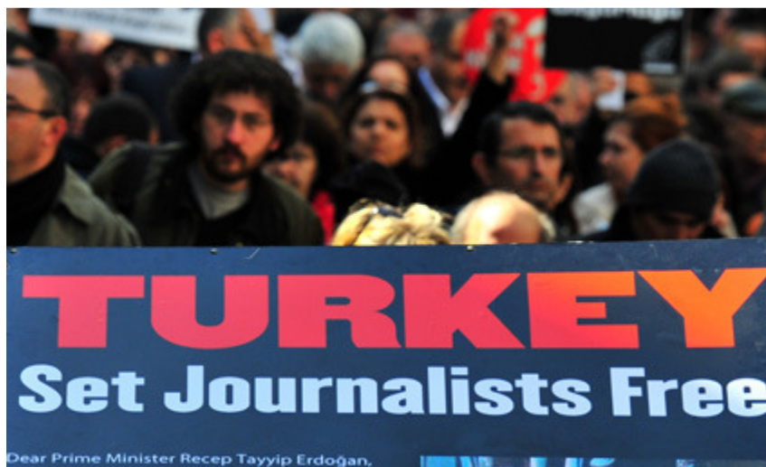
At least 49 journalists remain jailed in Turkey.

Worldwide tally reaches highest point since CPJ began surveys in 1990. Governments use charges of terrorism, other anti-state offenses to silence critical voices. Turkey is the world's worst jailer. A CPJ special report