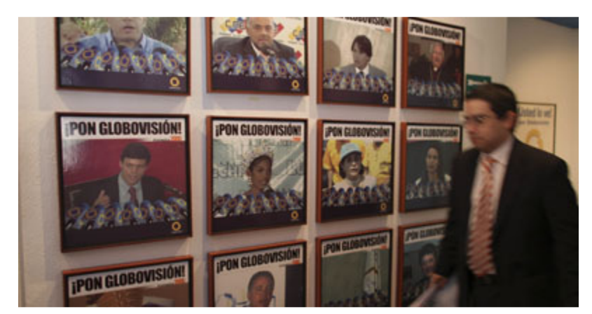
Globovisión advertisements in Caracas.

The recent regulatory probe into coverage at Globovisión, the only TV broadcaster critical of the Chávez administration, is the latest in a long string of investigations and other harassment. The network is struggling to stay afloat. By Monica Campbell