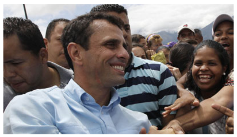
Henrique Capriles Radonski poses an unprecedented challenge to Chávez.

The administration has also blocked critical coverage, closed broadcasters, sued reporters for defamation, excluded those it deems unfriendly from official events, and harassed—with the help of government allies and state-run media—critical journalists. The result is that key issues—Chávez's health, rising unemployment, overcrowded prisons, and the condition of Venezuela's vital state-run energy sector—are not receiving indepth, investigative coverage at a critical moment for the country, as Chávez grapples not only with cancer but with an unprecedented challenge for his office from Henrique Capriles Radonski, the governor of the state of Miranda.