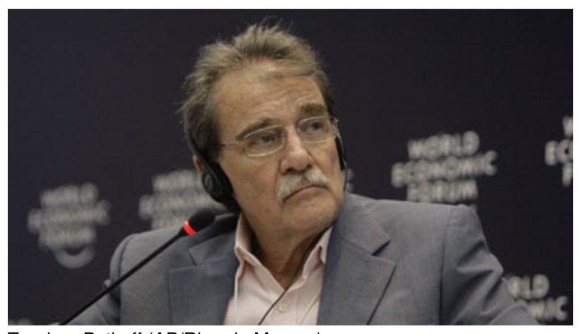
Teodoro Petkoff

Journalists have also been hampered by court rulings to limit publication of photos showing death or violence. In August 2010, the privately owned El Nacional published a photograph showing an overwhelmed Caracas morgue, with naked bodies piled on the tables and floor. A court then issued a temporary injunction banning the newspaper from printing images that contain "blood, guns, alarming messages, or physical aggression that could alter the psychological and moral well-being of children and adolescents." In response, El Nacional ran the word "Censored" in a blank space on its front page. In a show of solidarity, the independent newspaper Tal Cual reprinted the photograph and incurred a similar court ruling. Injunctions on both papers have since been lifted.