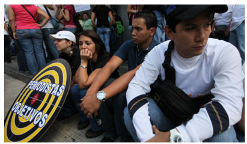
RCTV employees in 2010 after the station was pulled off cable television. The sign says, 'Journalists targets.'

And so he did. Since 2003, the government has financed the startup of ViVe TV, a nationwide cultural and educational television network; ANTV, which broadcasts National Assembly sessions on the airwaves and on cable; AN radio; Ávila TV, a regional channel run by the city of Caracas; Alba TV and Alba Ciudad FM; YVKE Mundial Radio; La Radio del Sur; the newspaper Correo del Orinoco ; and the news website Aporrea . Venezuelan Social Television Station, known as Tves, began broadcasting on May 28, 2007, a day after the country's oldest private television station, RCTV, was pulled off the air after 57 years. According to a 2007 CPJ report, the Venezuelan government failed to conduct a fair and transparent review of RCTV's concession renewal in an effort to silence its critical coverage. In 2010, government regulators also pulled RCTV from cable and satellite for not carrying Chávez's speeches.