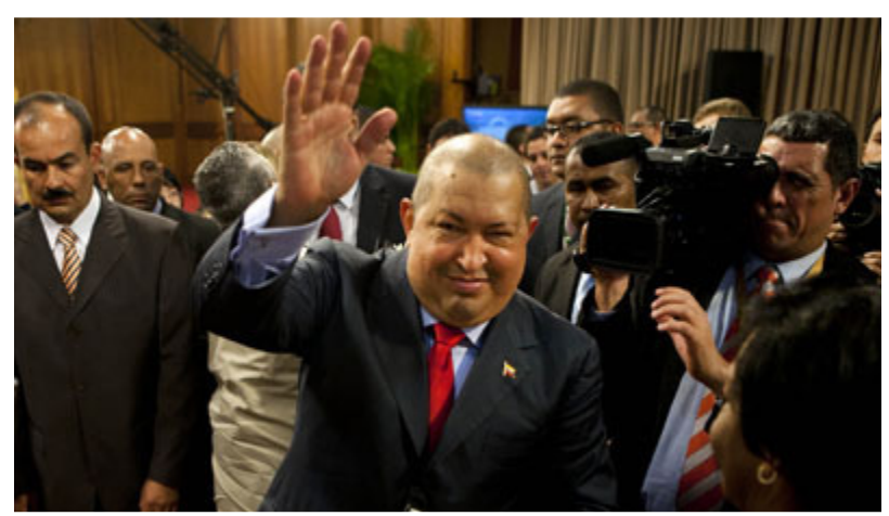
Hugo Chávez at a December 2011 press conference.

The Chávez administration has used an array of legislation, threats, and regulatory measures to gradually break down Venezuela's independent press while building up a state media empire—a complete reversal of the previous landscape. One result: Vital issues are going uncovered in an election year. A CPJ special report by Monica Campbell