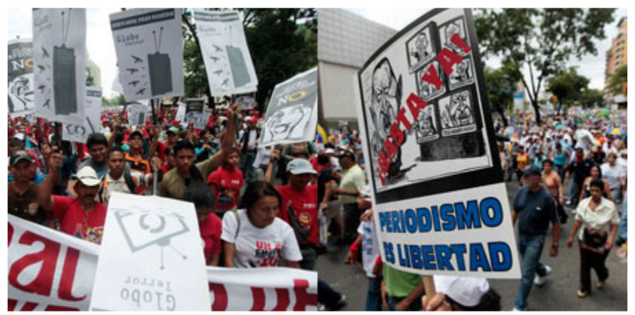
On June 27, 2009, some demonstrators, left, marched in support of regulators investigating Globovisión, while others, right, marched in support of the broadcaster.

In 2010, the legislature granted Chávez power to rule by decree, ostensibly to help flood victims, but the move came just weeks before a fresh slate of opposition politicians were to take their parliamentary seats, preempting any plans to limit Chávez's powers.