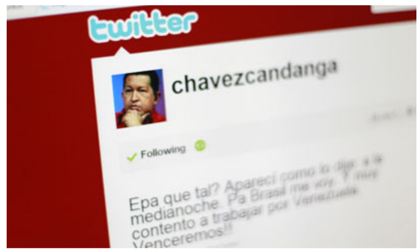
Hugo Chávez has more than 3 million followers on Twitter.